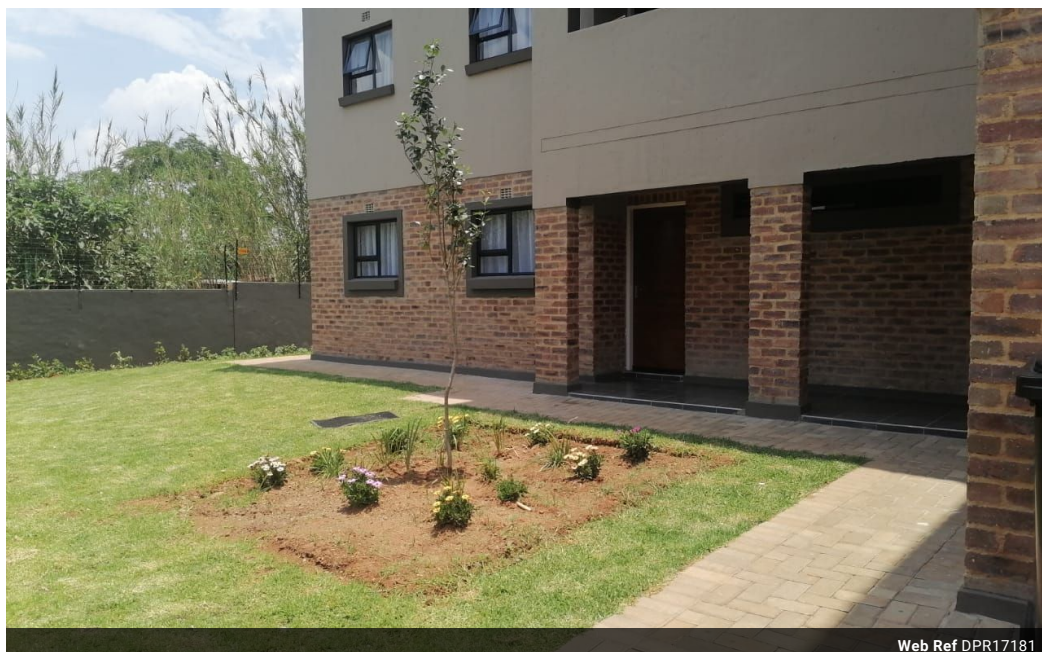
Web Ref DPR17181

18 Klip River Drive Three Rivers Vereeniging