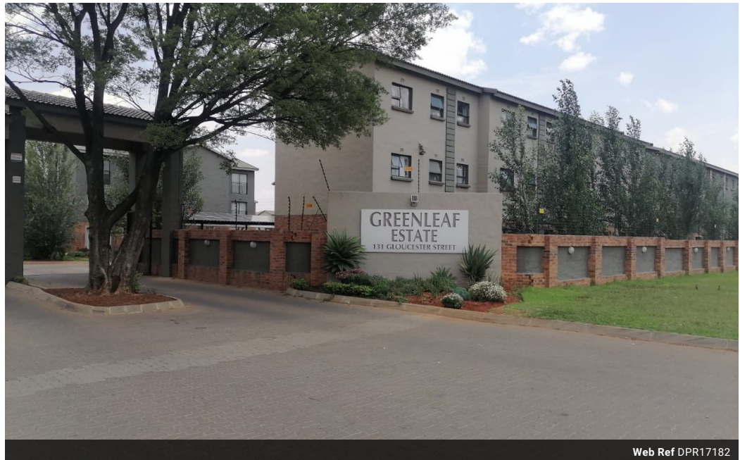
Web Ref DPR17182

18 Klip River Drive Three Rivers Vereeniging