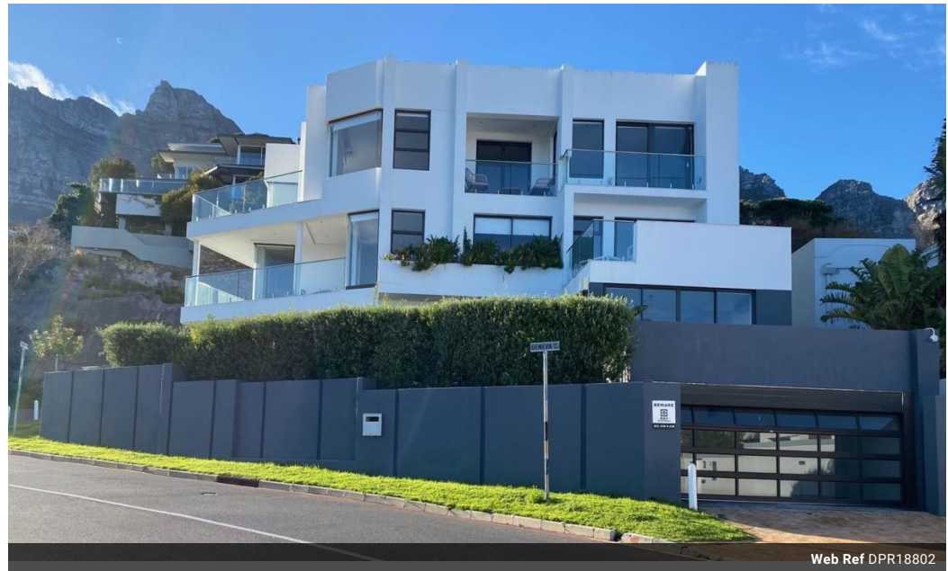
Web Ref DPR18802

Sonstraal Heights, 63 Melody Ridge, Durbanville