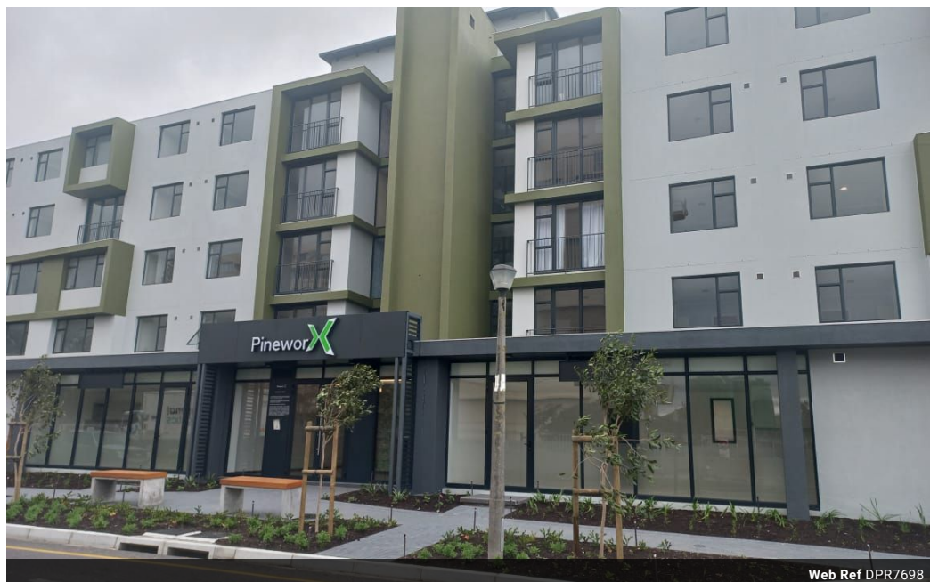
Web Ref DPR7698

Shop 3, Grand Parade 89 Victoria Road Camps Bay 8005