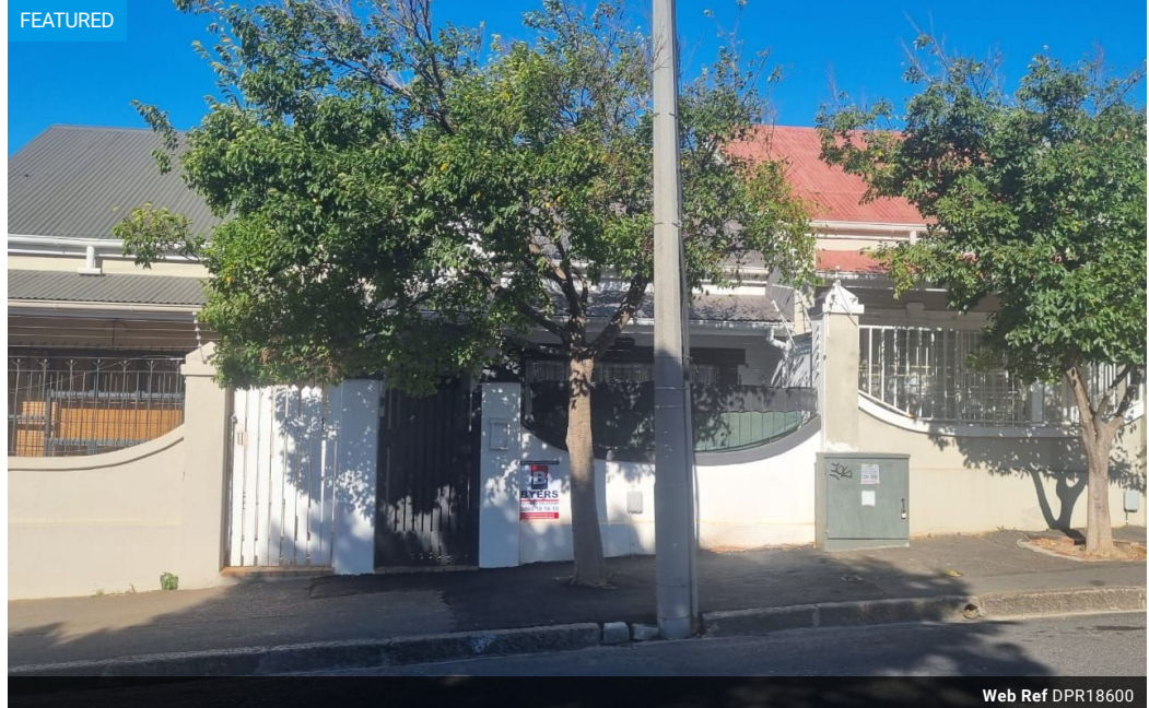
Web Ref DPR18600

Sonstraal Heights, 63 Melody Ridge, Durbanville