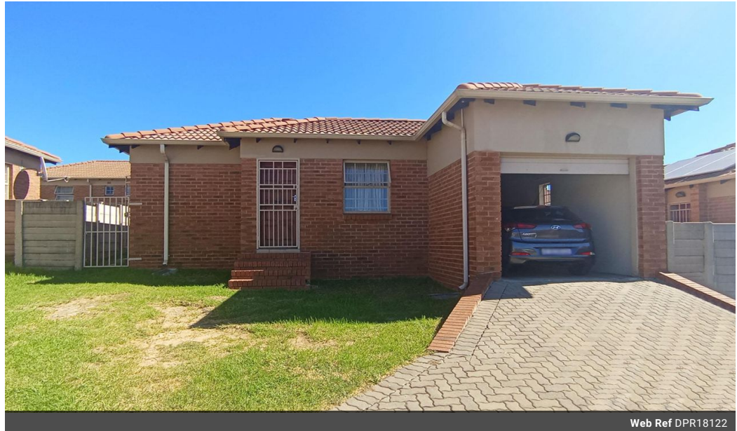
Web Ref DPR18122