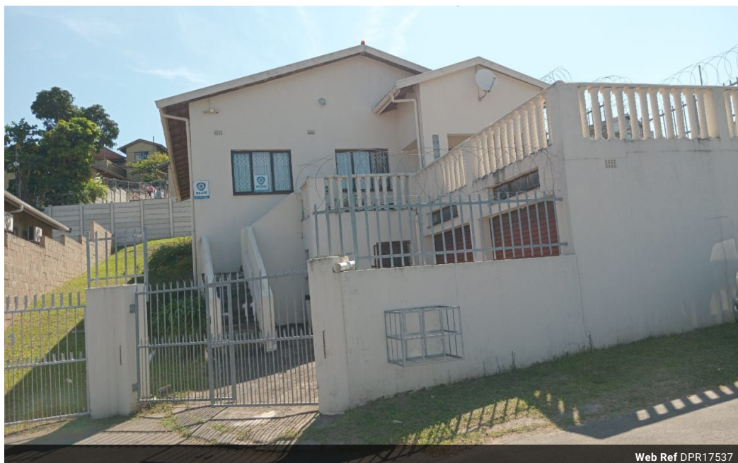
Web Ref DPR17537

558 Mountbatten Drive Reservoir Hills Durban 4090