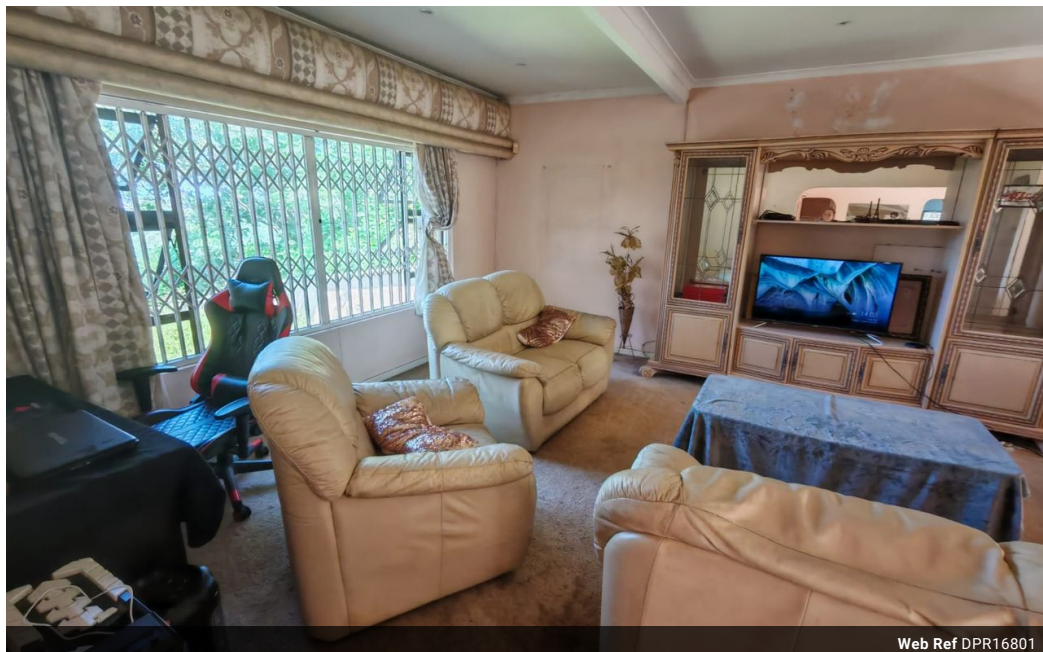
Web Ref DPR16801

Shop 2, 120 Stella Road Hillary Durban 4094