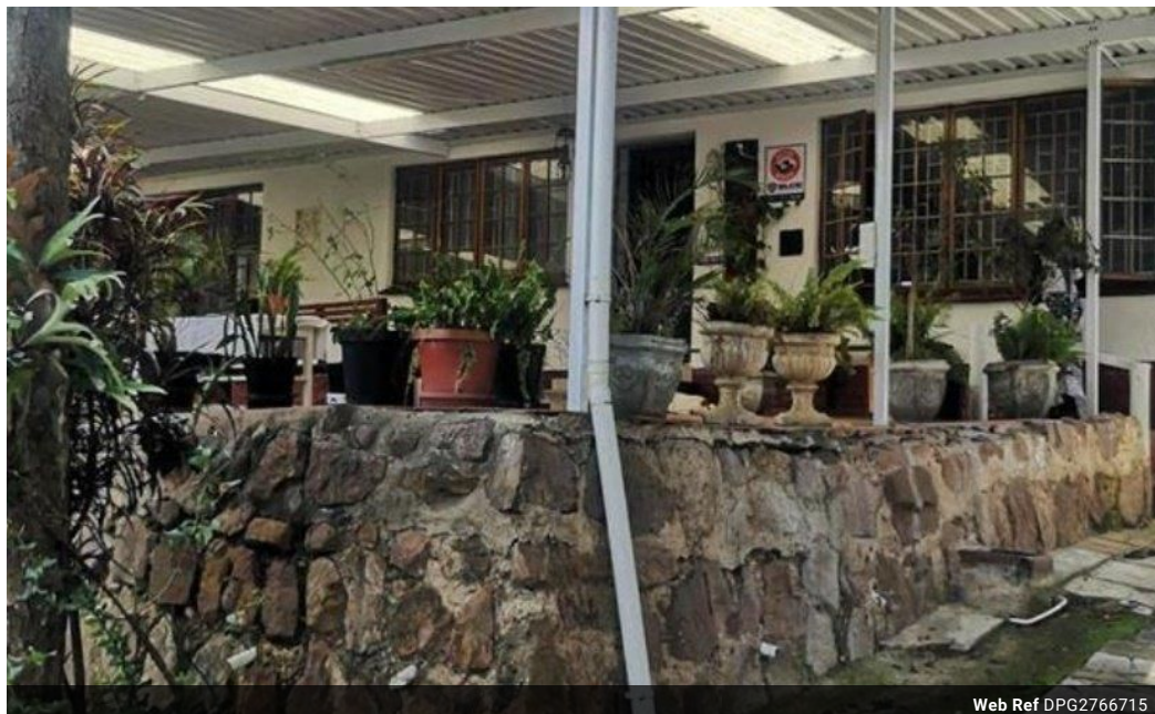
Web Ref DPG2766715

558 Mountbatten Drive Reservoir Hills Durban 4090