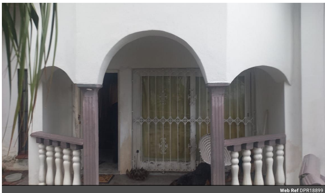
Web Ref DPR18899

3 Oslo Building 394 Ester Roberts Road Glenwood Durban 4001