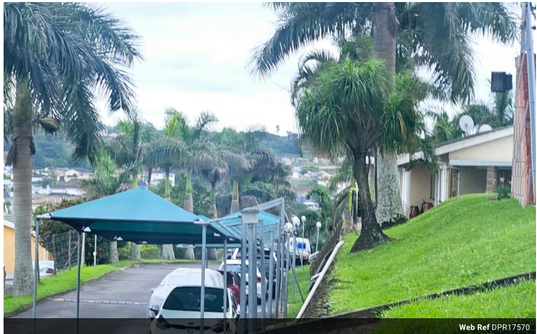
Web Ref DPR17570

558 Mountbatten Drive Reservoir Hills Durban 4090