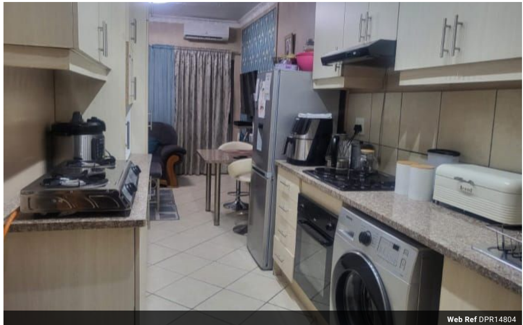
Web Ref DPR14804

558 Mountbatten Drive Reservoir Hills Durban 4090