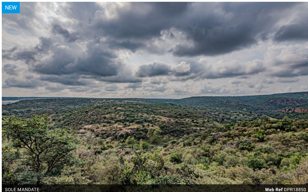
SOLE MANDATE Web Ref DPR18850