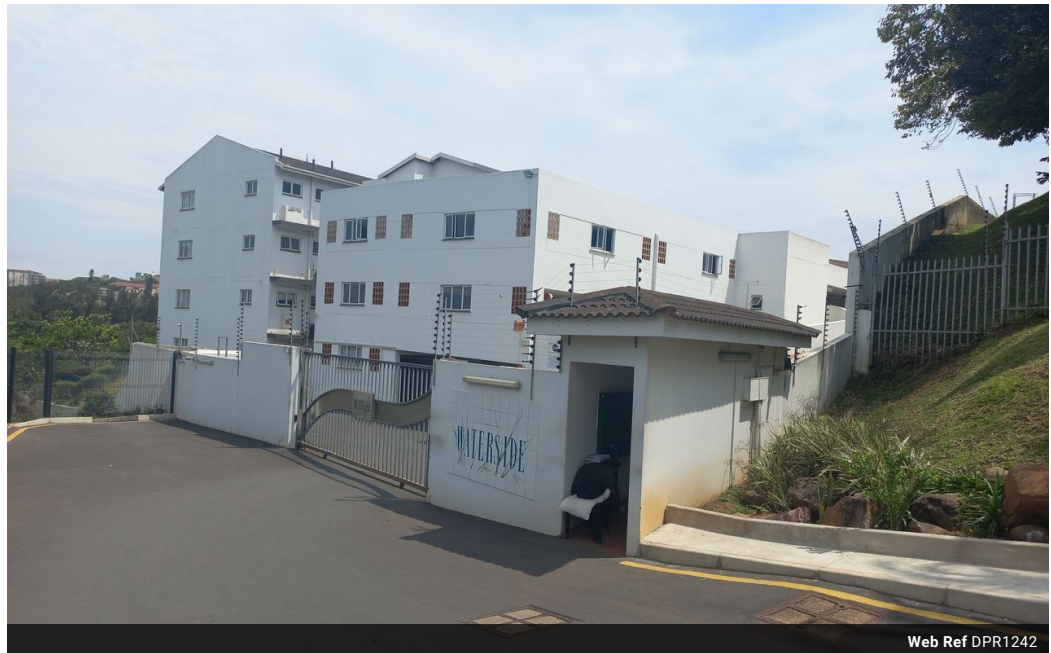
Web Ref DPR1242