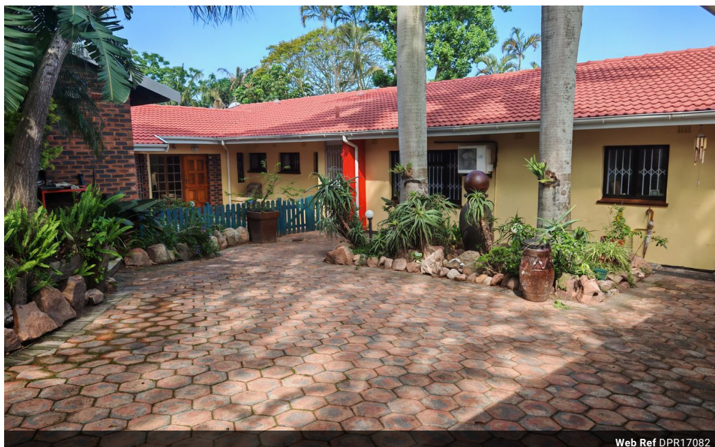
Web Ref DPR17082

1 Knightbridge, 16 Westville Road, Westville