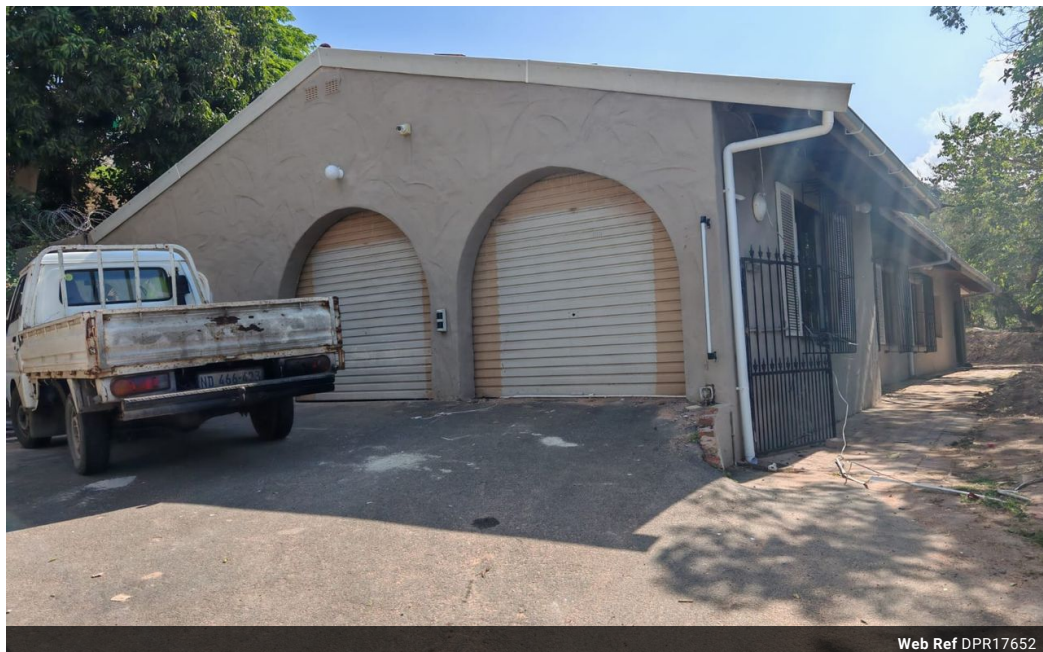
Web Ref DPR17652

1 Knightbridge, 16 Westville Road, Westville