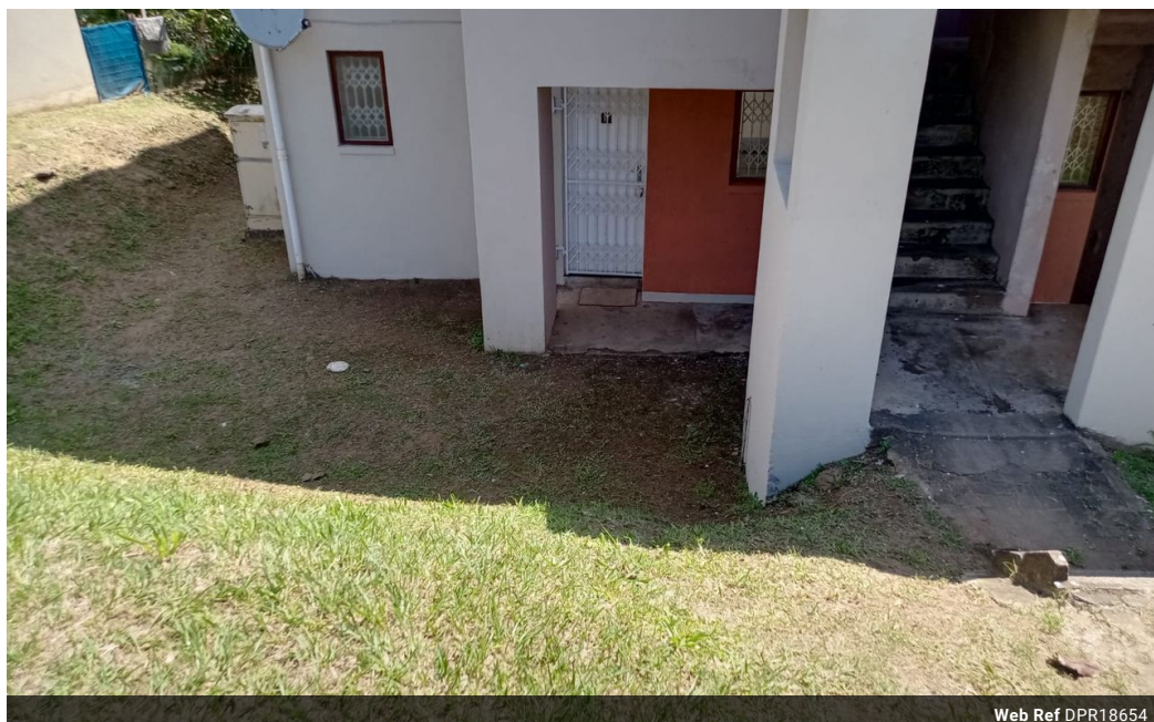
Web Ref DPR18654

Shop 2, 120 Stella Road Hillary Durban 4094