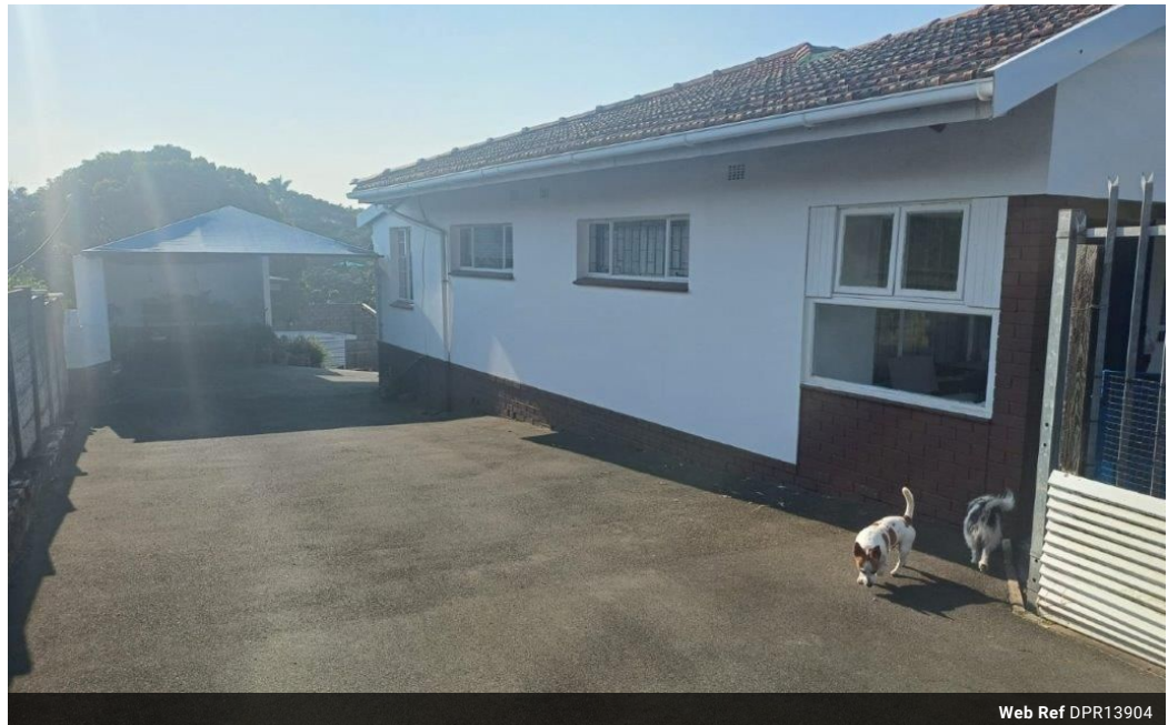
Web Ref DPR13904

Shop 2, 120 Stella Road Hillary Durban 4094