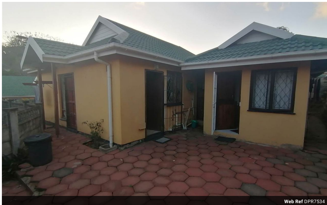
Web Ref DPR7534

Shop 2, 120 Stella Road Hillary Durban 4094