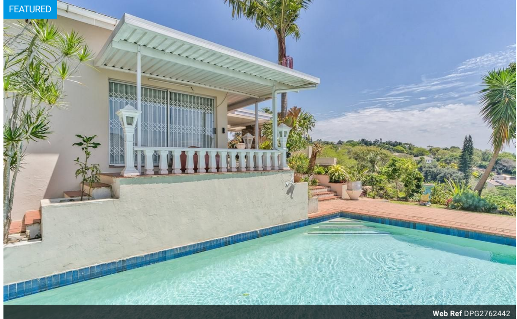
Web Ref DPG2762442

1 Knightbridge, 16 Westville Road, Westville