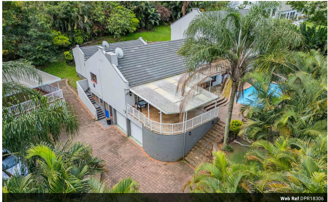
Web Ref DPR18306

Shop 1, Gordana Court, 22/26 Salisbury Avenue, Westville