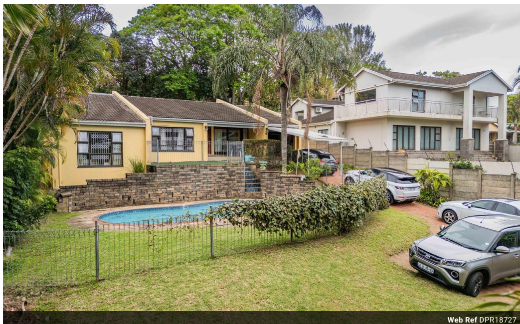
Web Ref DPR18727

1 Knightbridge, 16 Westville Road, Westville