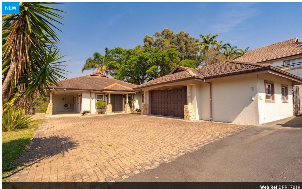
Web Ref DPR17019

1 Knightbridge, 16 Westville Road, Westville