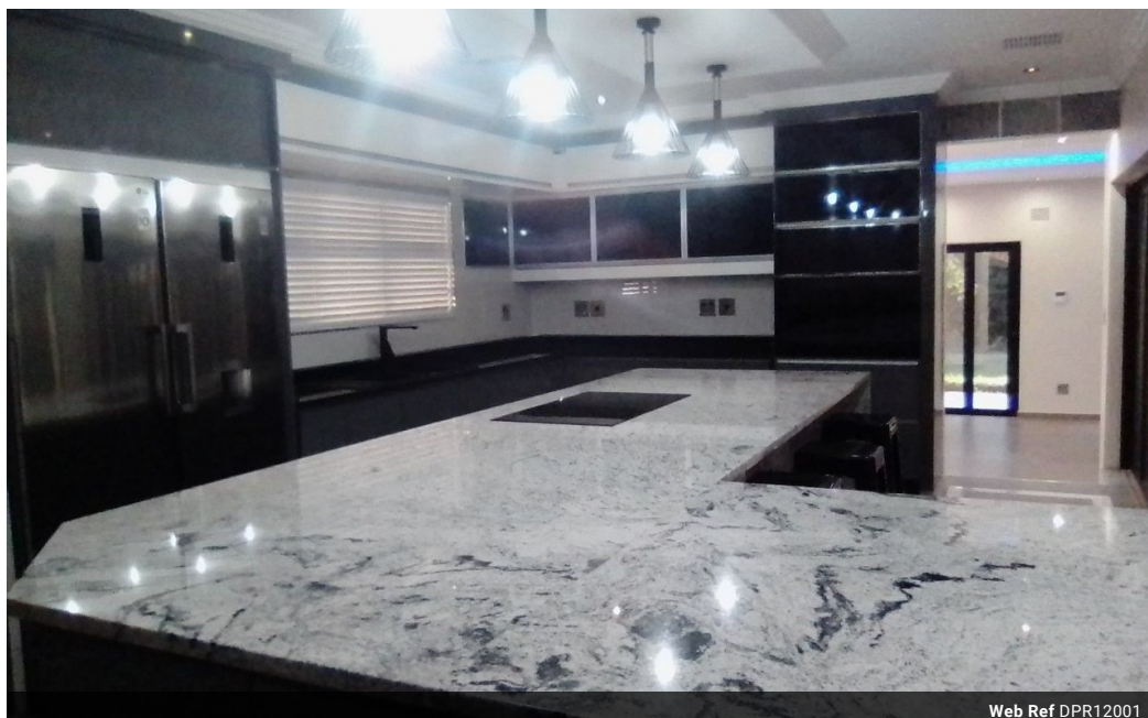
Web Ref DPR12001

Shop 1, Gordana Court, 22/26 Salisbury Avenue, Westville