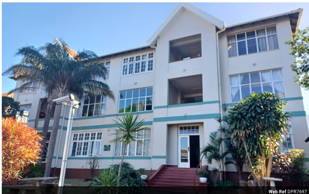
Web Ref DPR7697