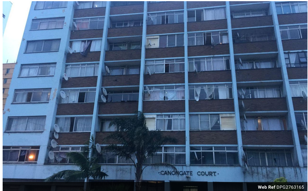
Web Ref DPG2763165

279 Problem Mkhize Road, Essenwood, Durban, 4001