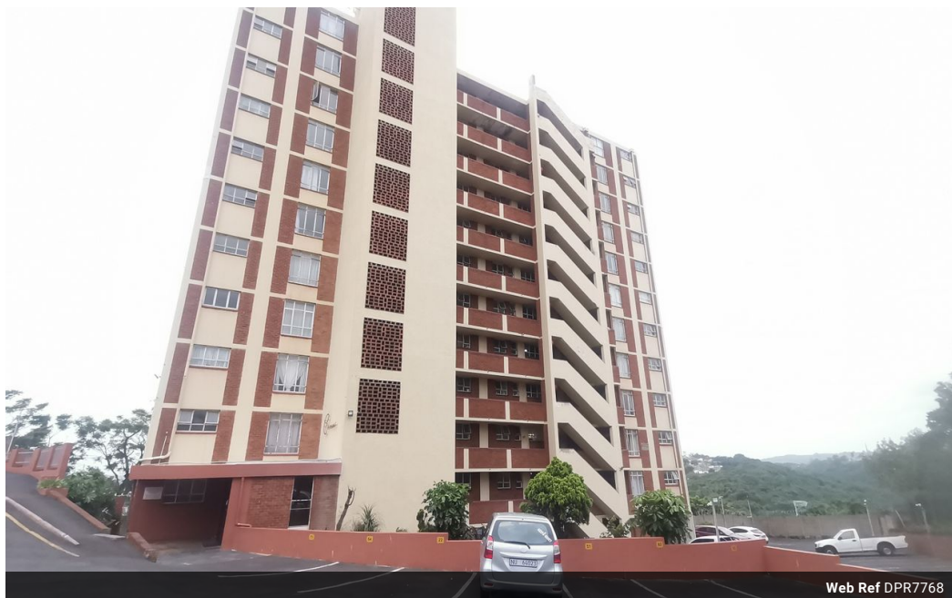
Web Ref DPR7768

3 Oslo Building 394 Ester Roberts Road Glenwood Durban 4001