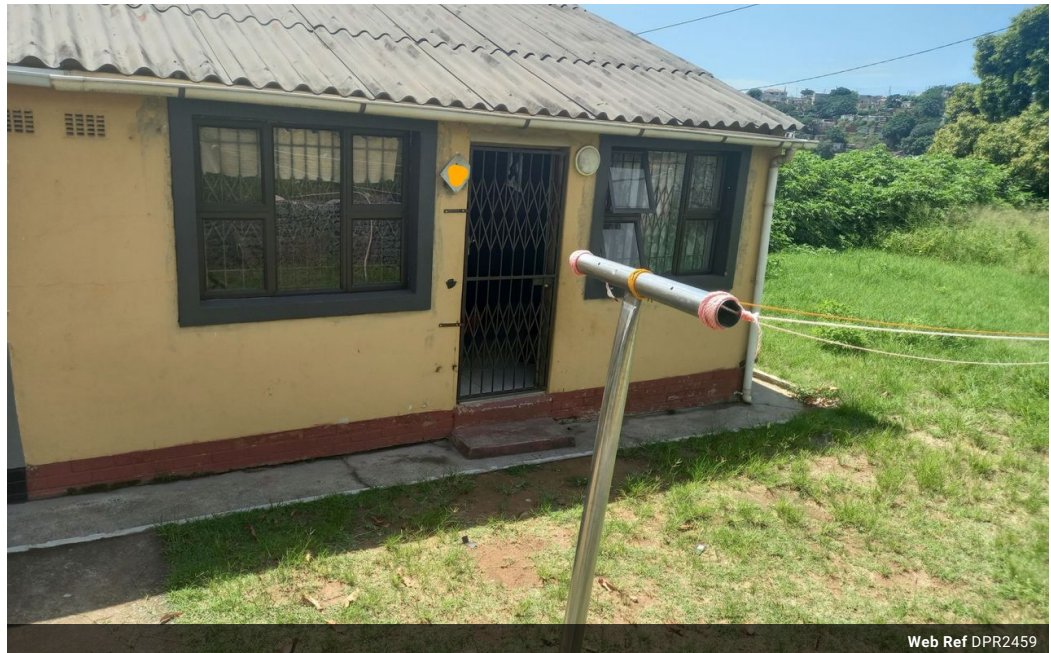
Web Ref DPR2459

343 Anton Lembede Street 511 Perm Building Durban 4001