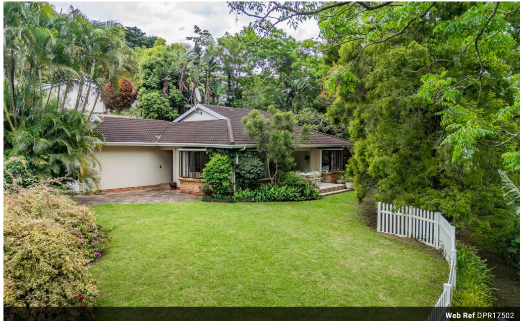
Web Ref DPR17502

Shop 1, Gordana Court, 22/26 Salisbury Avenue, Westville