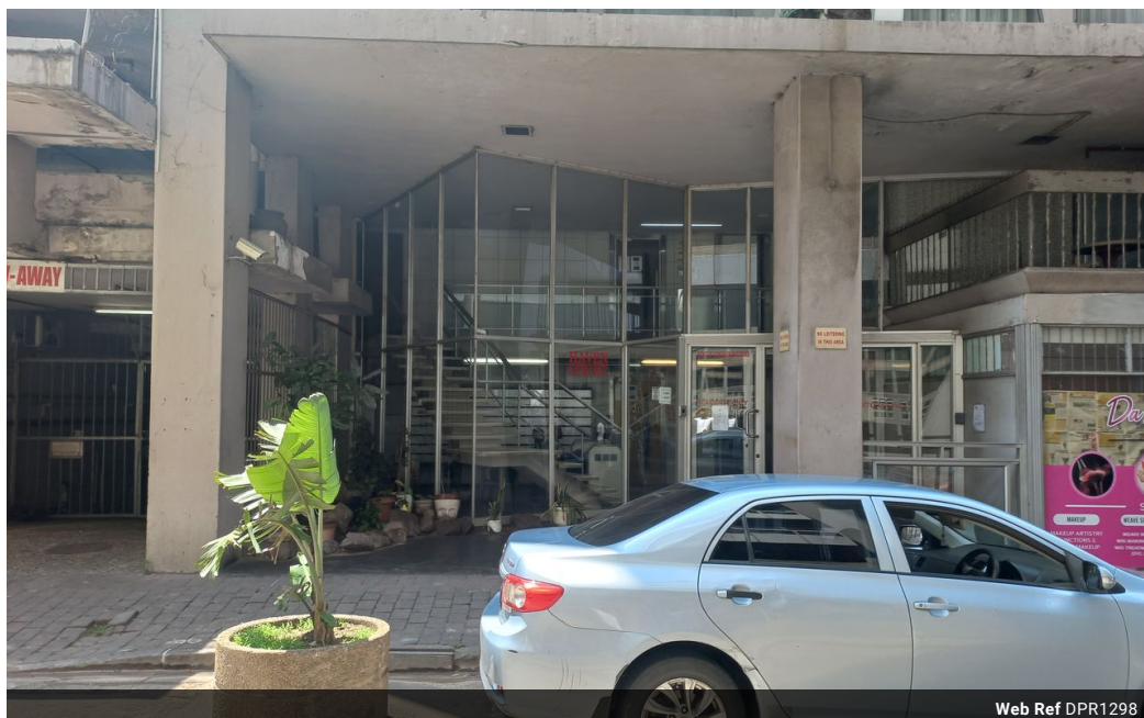
Web Ref DPR1298