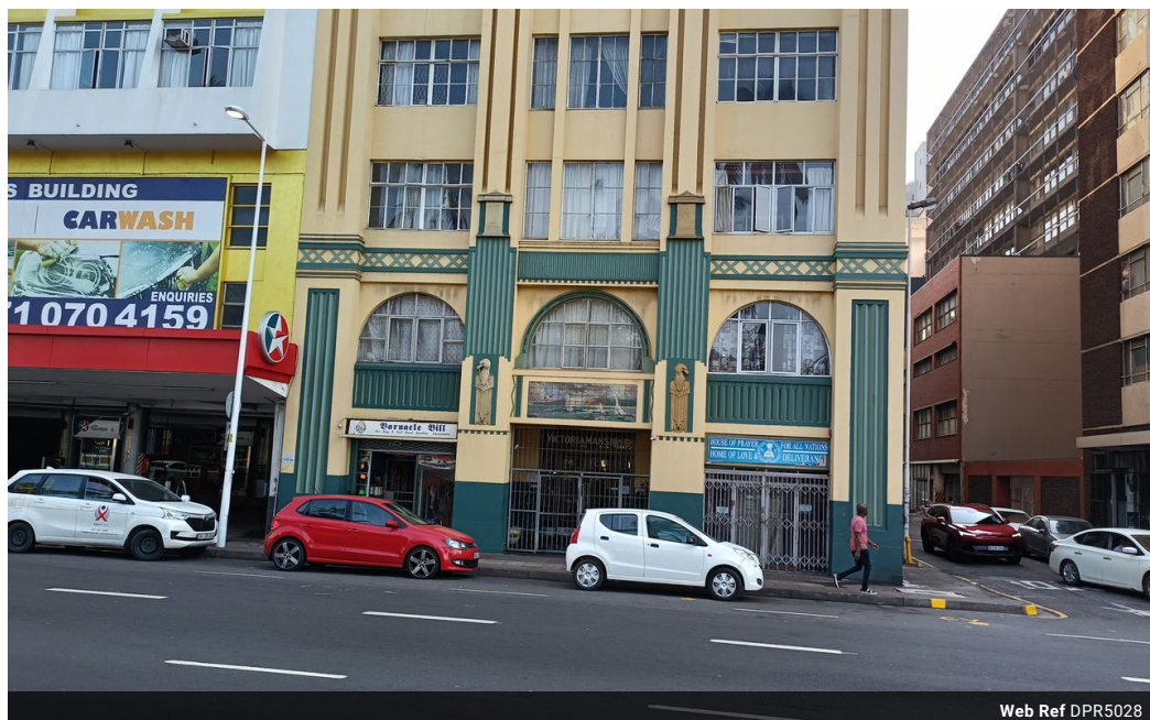
Web Ref DPR5028