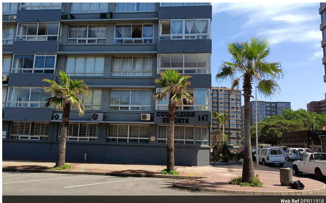
Web Ref DPR11918