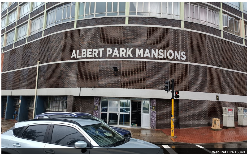
Web Ref DPR16349