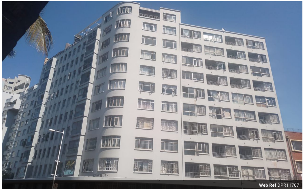
Web Ref DPR11767

3 Oslo Building 394 Ester Roberts Road Glenwood Durban 4001