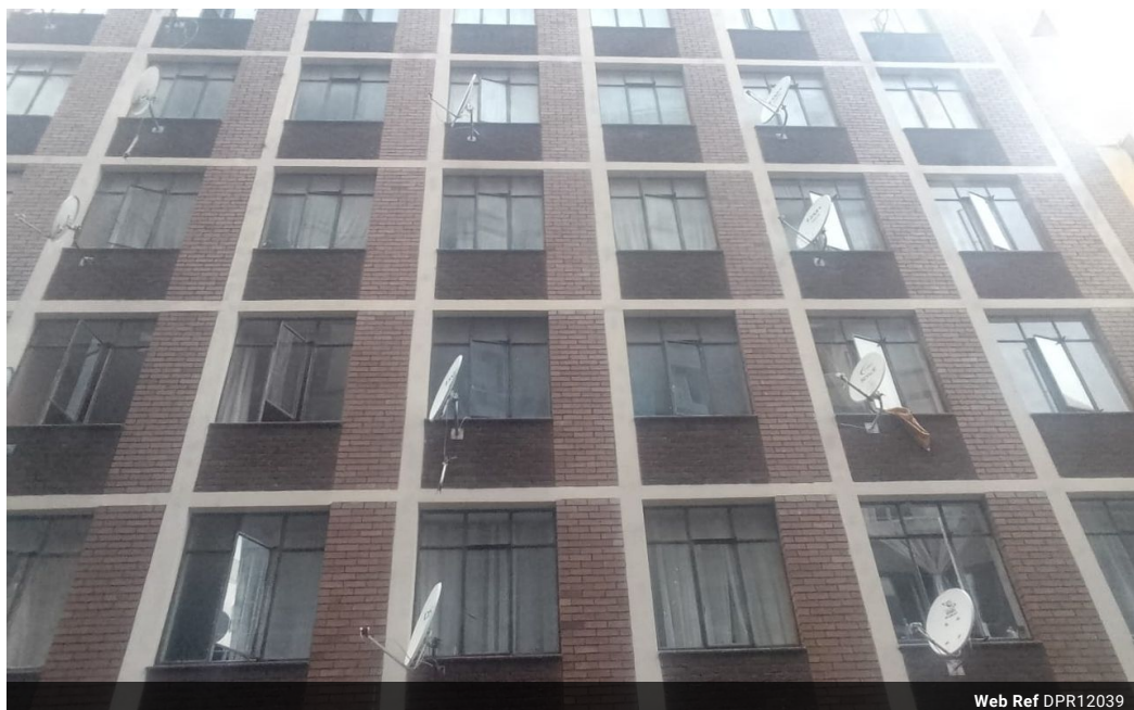
Web Ref DPR12039

3 Oslo Building 394 Ester Roberts Road Glenwood Durban 4001