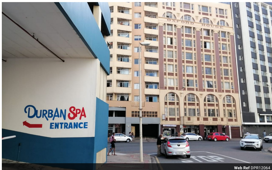
Web Ref DPR12064

3 Oslo Building 394 Ester Roberts Road Glenwood Durban 4001