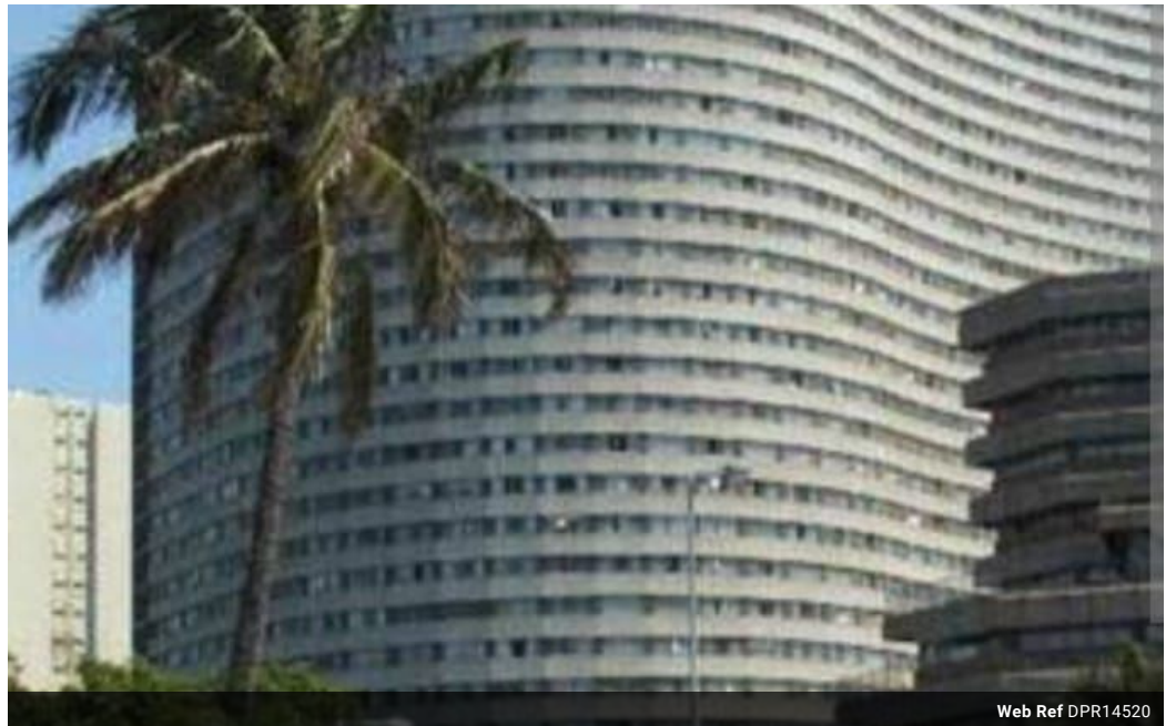
Web Ref DPR14520

3 Oslo Building 394 Ester Roberts Road Glenwood Durban 4001