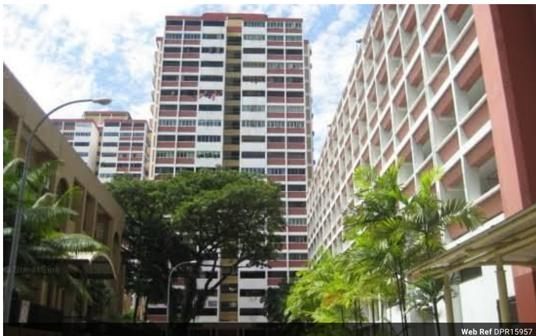
Web Ref DPR15957

558 Mountbatten Drive Reservoir Hills Durban 4090