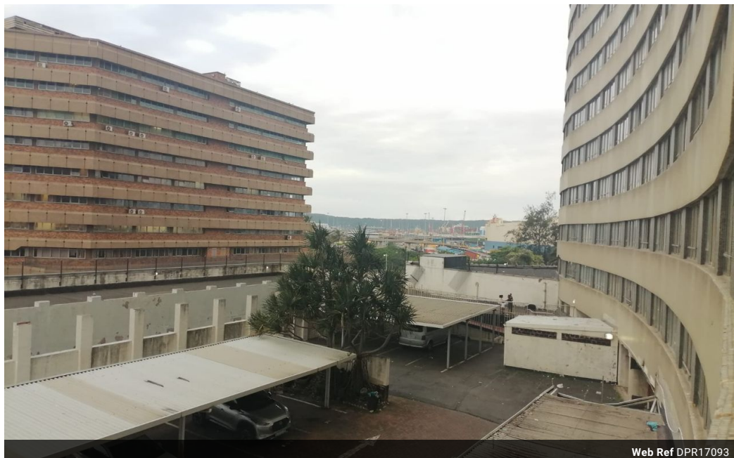
Web Ref DPR17093

3 Oslo Building 394 Ester Roberts Road Glenwood Durban 4001