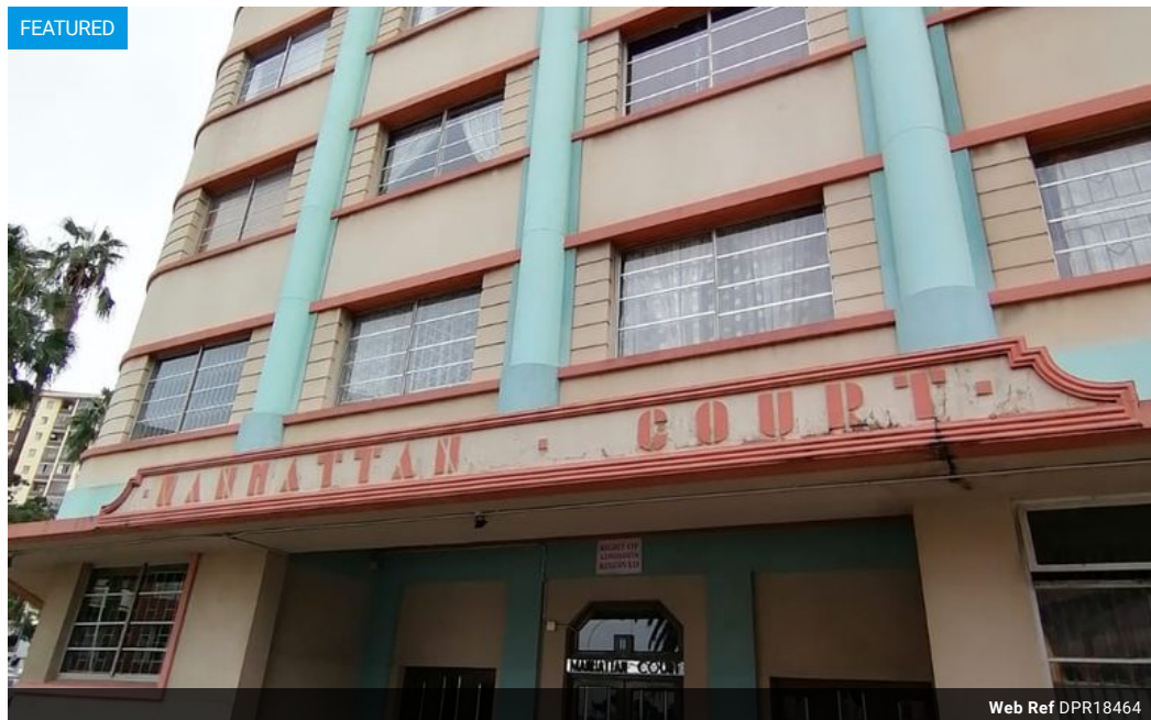
Web Ref DPR18464