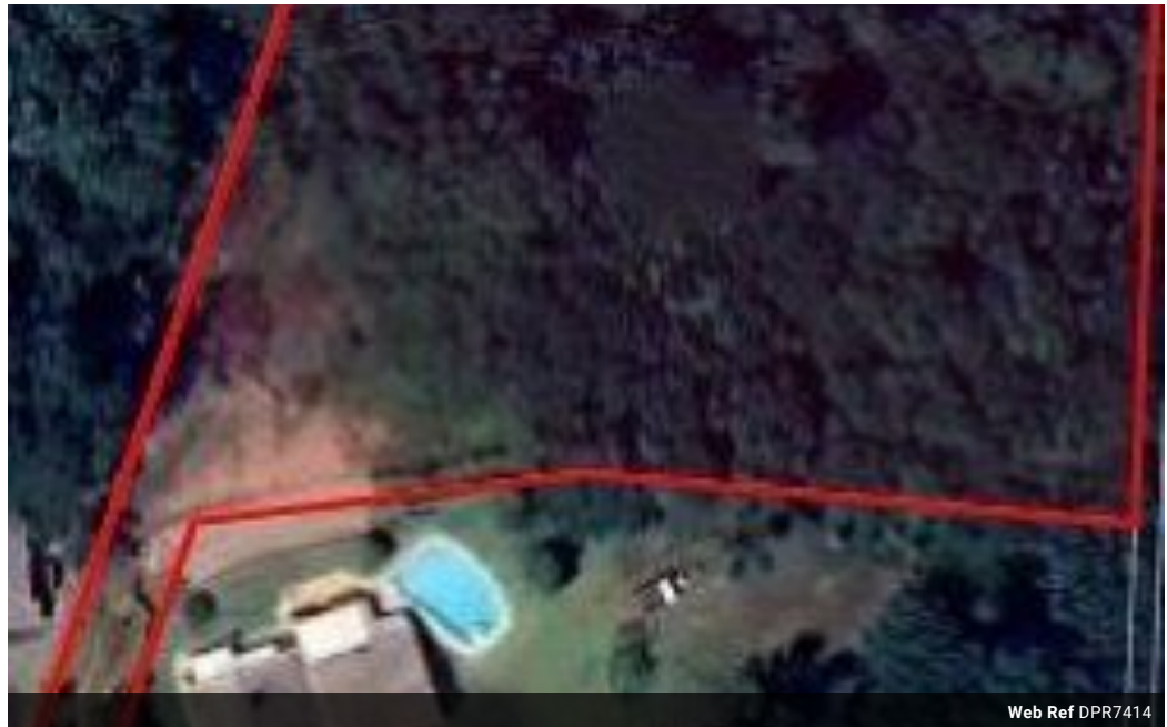
Web Ref DPR7414

1 Knightbridge, 16 Westville Road, Westville