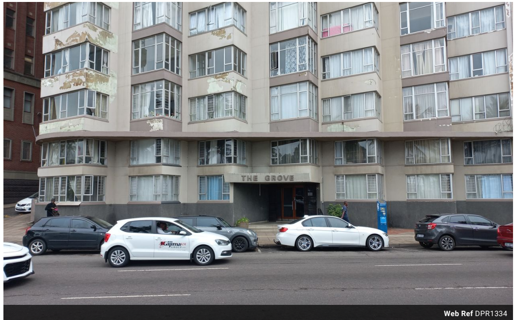
Web Ref DPR1334