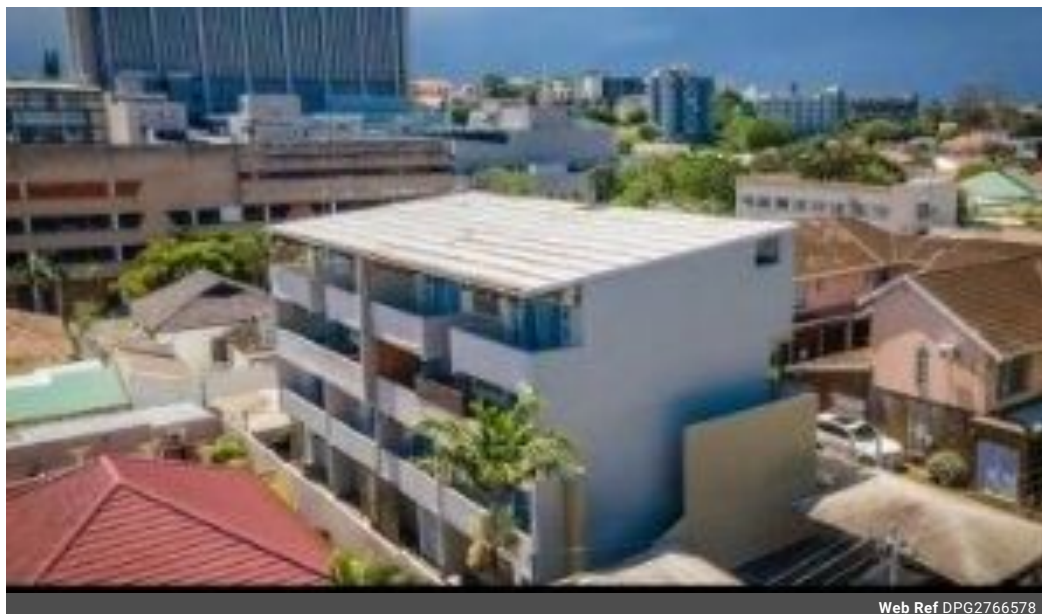
Web Ref DPG2766578

558 Mountbatten Drive Reservoir Hills Durban 4090