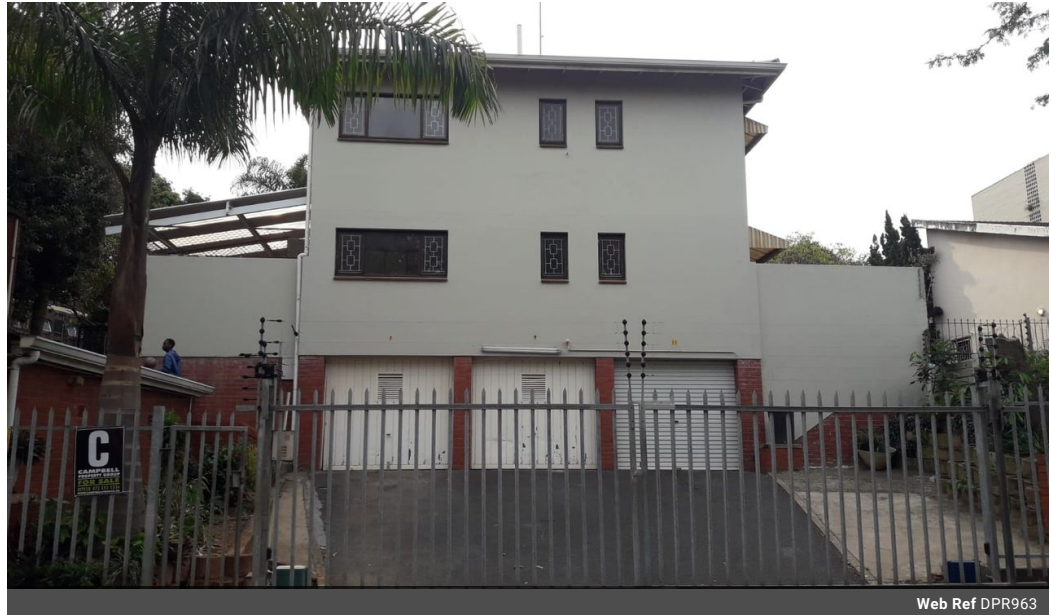
Web Ref DPR963

279 Problem Mkhize Road, Essenwood, Durban, 4001