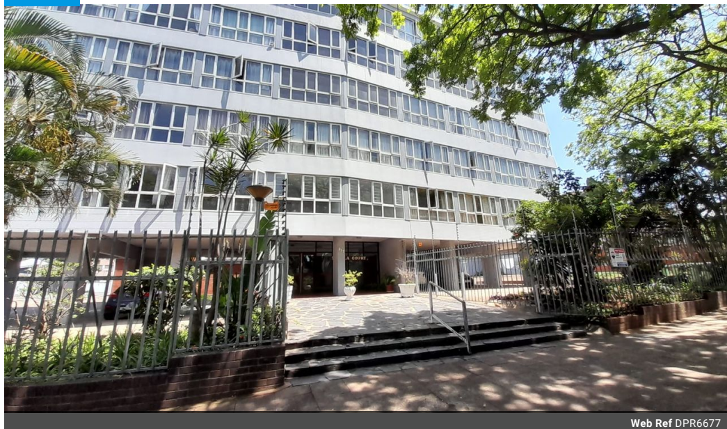
Web Ref DPR6677