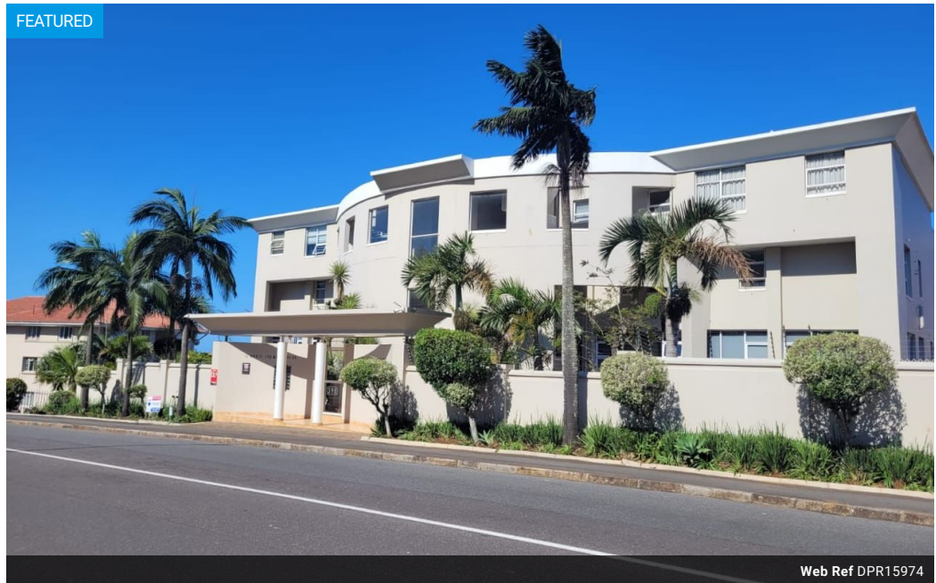
Web Ref DPR15974