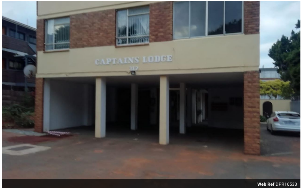
Web Ref DPR16533

3 Oslo Building 394 Ester Roberts Road Glenwood Durban 4001