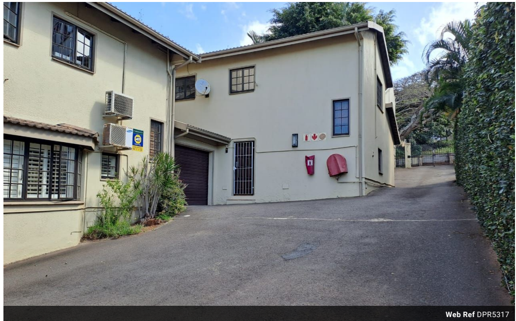
Web Ref DPR5317

3 Oslo Building 394 Ester Roberts Road Glenwood Durban 4001