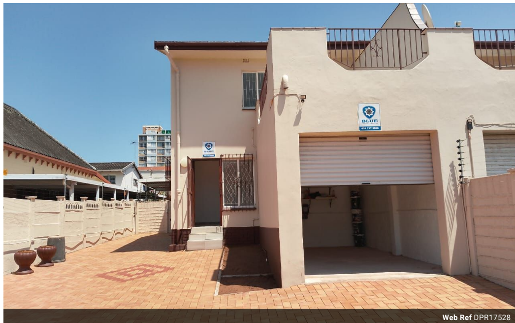
Web Ref DPR17528

3 Oslo Building 394 Ester Roberts Road Glenwood Durban 4001