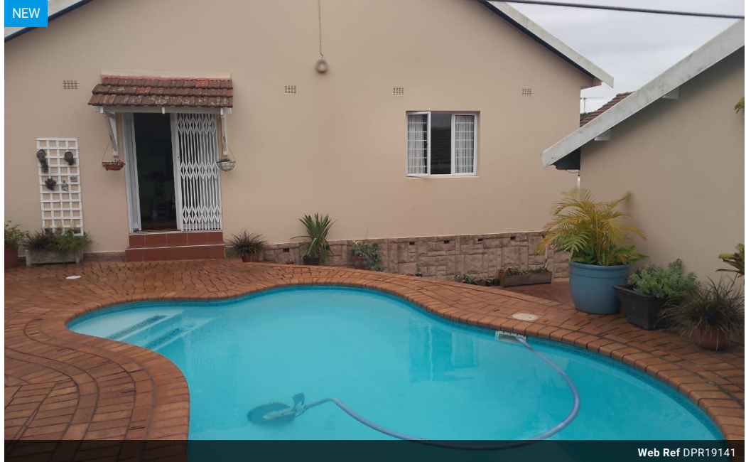
Web Ref DPR19141

3 Oslo Building 394 Ester Roberts Road Glenwood Durban 4001